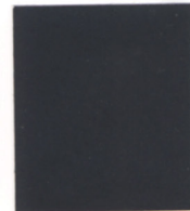
DUSTY CHARCOAL PVDF 3