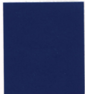
AZURE BLUE PVDF 3