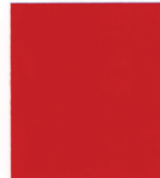
PATRIOT RED PVDF 3