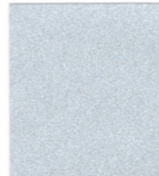
SILVER METALLIC PVDF 3/SRI 58