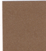
HAZELNUT MICA PVDF 2/SRI 40