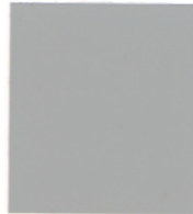
CADET GRAY PVDF 2/SRI 51