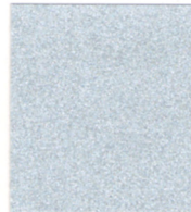
SUNRISE SILVER PVDF 3/SRI 30