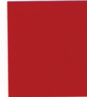
RED FIRE PVDF 3/SRI 35