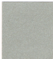
ANODIC SATIN PVDF 2