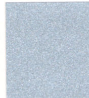
BRILLIANT SILVER METALLIC PVDF 3/SRI 73