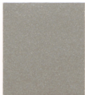
HARVEST GOLD MICA PVDF 2