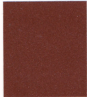
RUSSET MICA PVDF 3/SRI 38