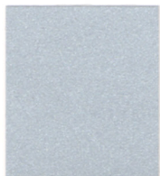
PLATINUM MICA PVDF 2/SRI 61