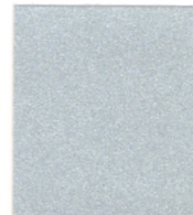
CHAMPAGNE METALLIC PVDF 3