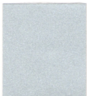
ANODIC CLEAR PVDF 2