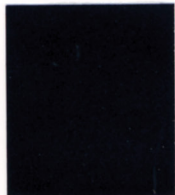
FOCUS BLACK PVDF 3/SRI 30